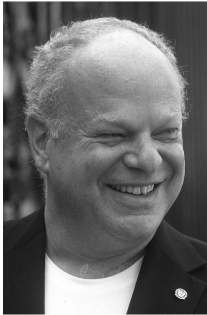
Martin E. P. Seligman